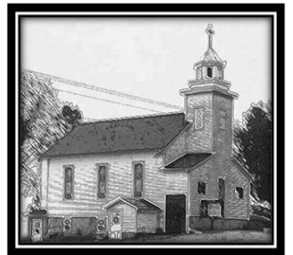
Liberty Pole UMC S6759 Hwy. 27 Viroqua, WI 54665