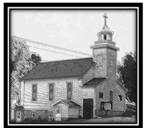
Liberty Pole UMC S6759 Hwy. 27 Viroqua, WI 54665