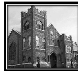
Viroqua UMC 221 S. Center Ave. Viroqua, WI 54665