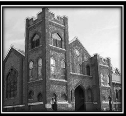
Viroqua UMC 221 S. Center Ave. Viroqua, WI 54665