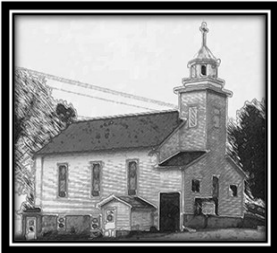
Liberty Pole UMC S6759 Hwy. 27 Viroqua, WI 54665