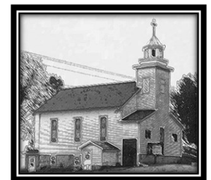
Liberty Pole UMC S6759 Hwy. 27 Viroqua, WI 54665