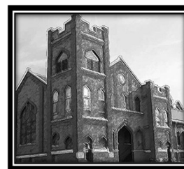
Viroqua UMC 221 S. Center Ave. Viroqua, WI 54665