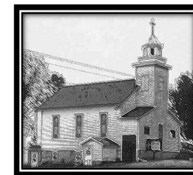
Liberty Pole UMC S6759 Hwy. 27

Viroqua & Liberty Pole United Methodist Churches